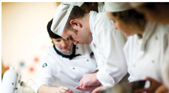
Commercial cookery and patisserie