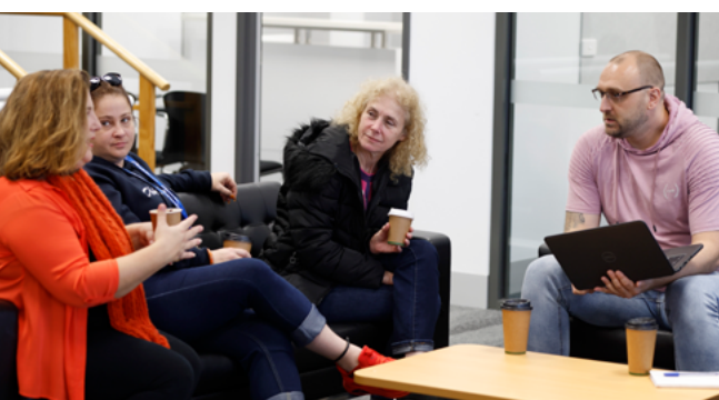
Community and Social services