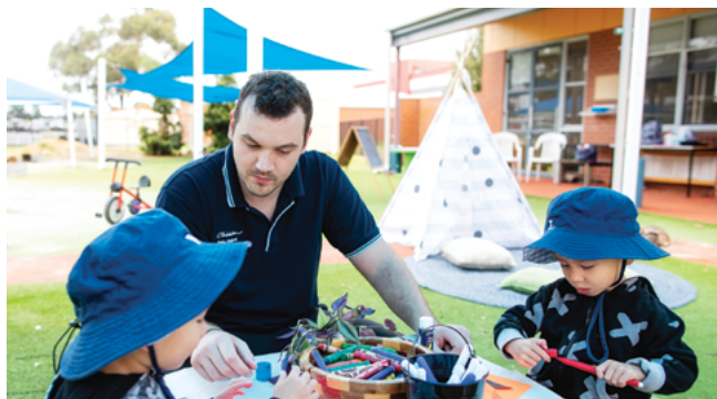
Early childhood education