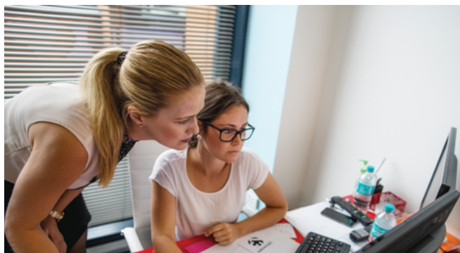
Accounting and management